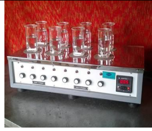
46. Multi Magnetic Stirrer