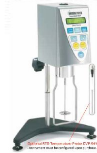
63. Brookfield Viscometer