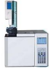
56. Gas Chromatographer