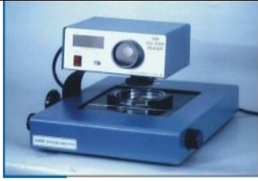
44. Digital Antibiotic Zone Reader