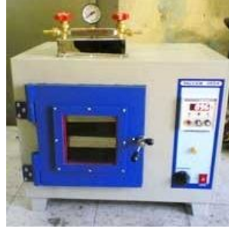
59. Rectangular Vacuum Oven