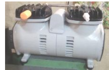
62. Oil Free Vacuum Pump