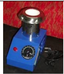
64. Bunsen Burner