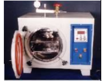
60. Round Vacuum Oven