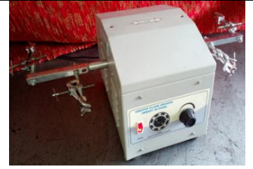
47. Griffin Flask Shaker