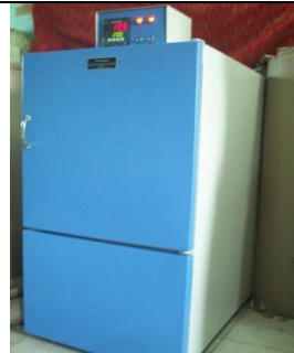
67. Environmental Chamber