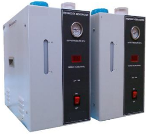
53. Hydrogen Gas Generator