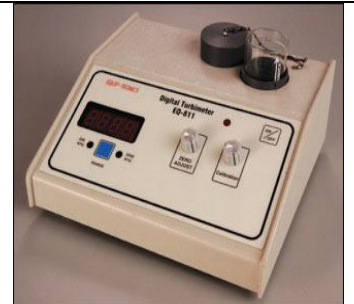
68. Nephelometer/Turbidity Meter