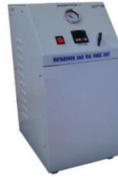
55. Nitrogen Gas Generator