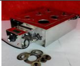
66. Rectangular Water Bath