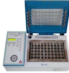
54. Nitrogen Concentrator