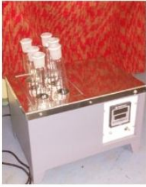
57. COD Digester in Hot Air Chamber