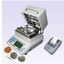
58. Moisture Balance