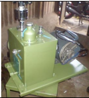
61. Oil Seal Vacuum Pump